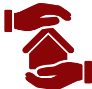
REAL ESTATE DEVELOPER