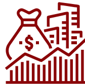
REAL ESTATE INVESTMENT